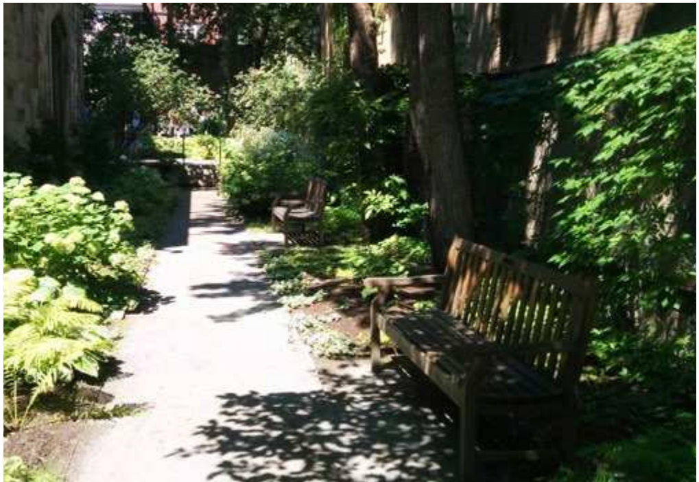
A tranquil summer day in the Quiet Garden.