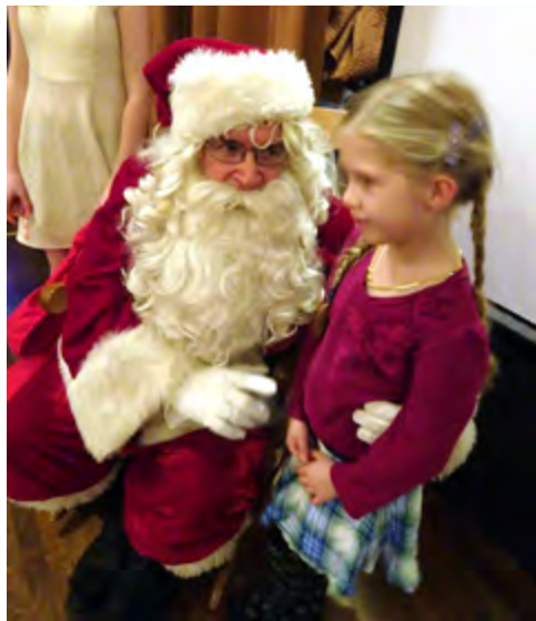
Santa comes to A&P

Our Church School has been very busy since our last publication and there is much to report on. I will touch on many of the wonderful highlighted activities we have enjoyed, as well as more events coming up over the summer months through to September.