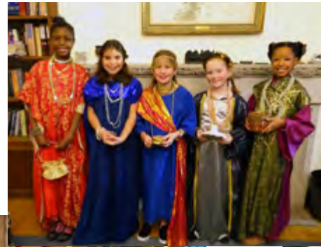
Christmas Pageant and Family Christmas Eve Service