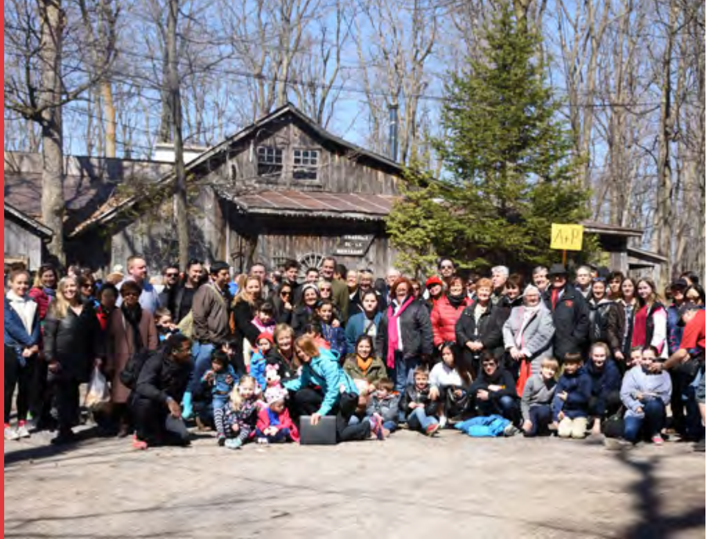
Fun and Fellowship at an Authentic Cabane à sucre