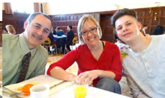
Celebrating mothers, grandmothers and other special women