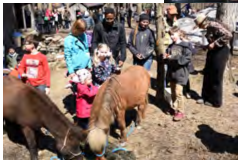
Over 90 people enjoyed their visit to Sucerie de la Montagne