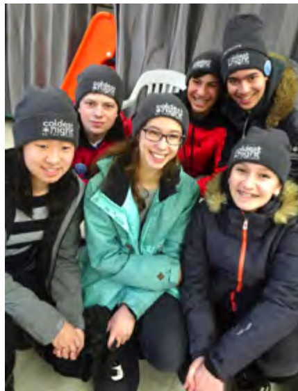
Clockwise from top left: Easter morning SONrise Service, Coldest Night Fundraiser, Youth Retreat, and Bowl-A-Thon Fundraiser