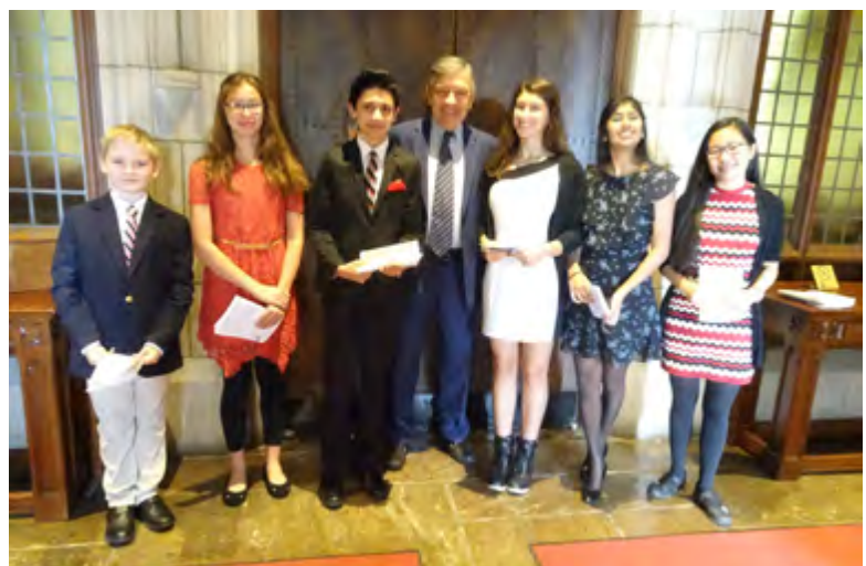
Below: Ready for ushering duty