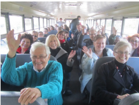
Above: Homeward bound after a great outing!