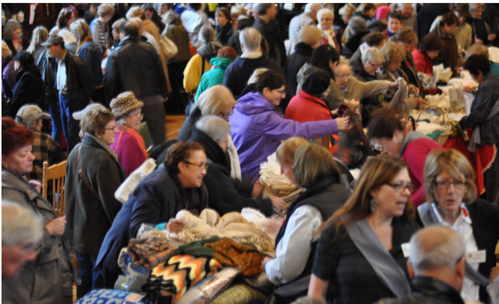
Top left: Expectant customers lining up down the block!