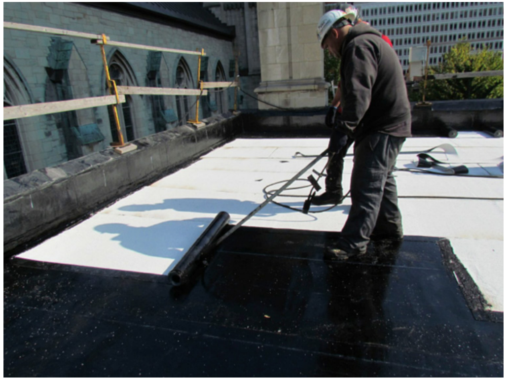
Two rather unusual views around the church!

A major project of the Board was completed this Fall. There had been leaks in the roof of Kildonan Hall, combined with a need to correct some things that over the years had fallen apart. Insulation needed to be added to preserve heat in winter and keep things cooler in summer. Careful choices were made over several months of project management help, and companies with appropriate expertise. Big construction equipment filled the driveway for almost two weeks as the new roof was installed. Replacement of the roof actually took seven working days, and the work was done to everyone's satisfaction. The flashing around the edge was completed just recently to ensure that everything was well sealed. So "thank you" to the church team that oversaw the work. Perhaps the next time you are in Kildonan Hall, you will remember all the work that went into making sure it is watertight and well insulated!