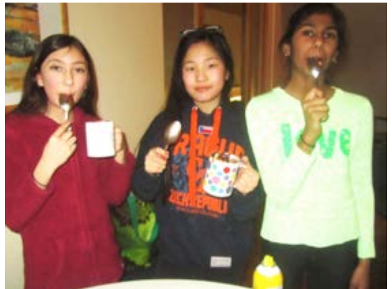
Left: Music maketh merry!