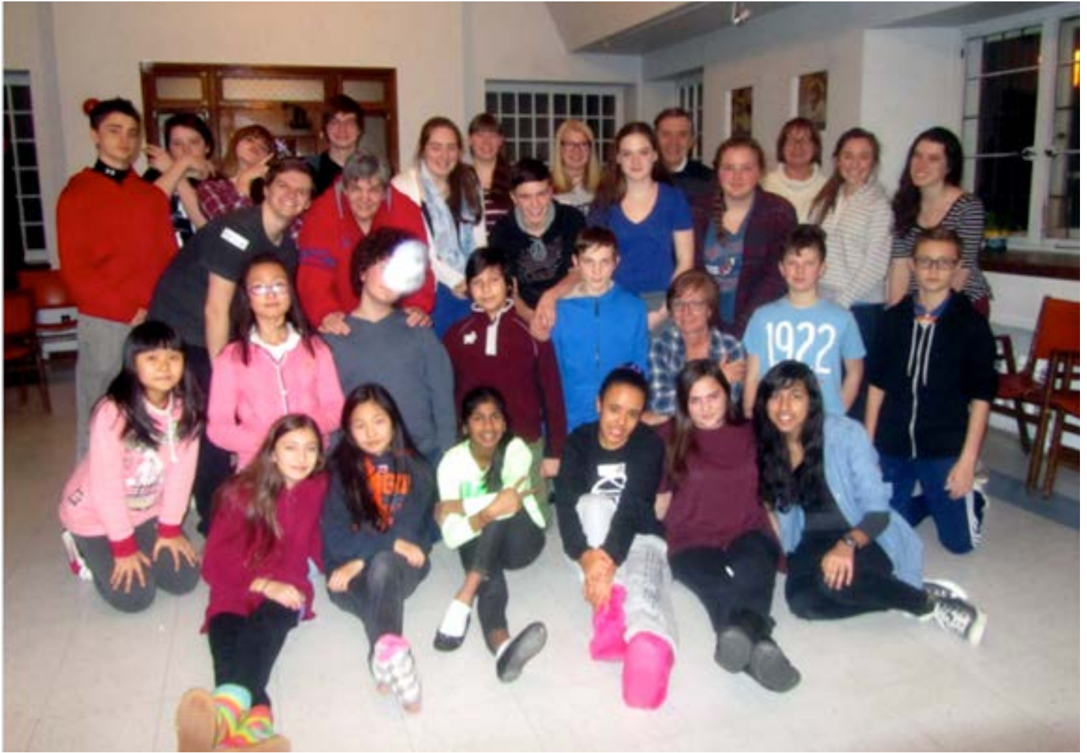
Everyone had a great time – on to next year!