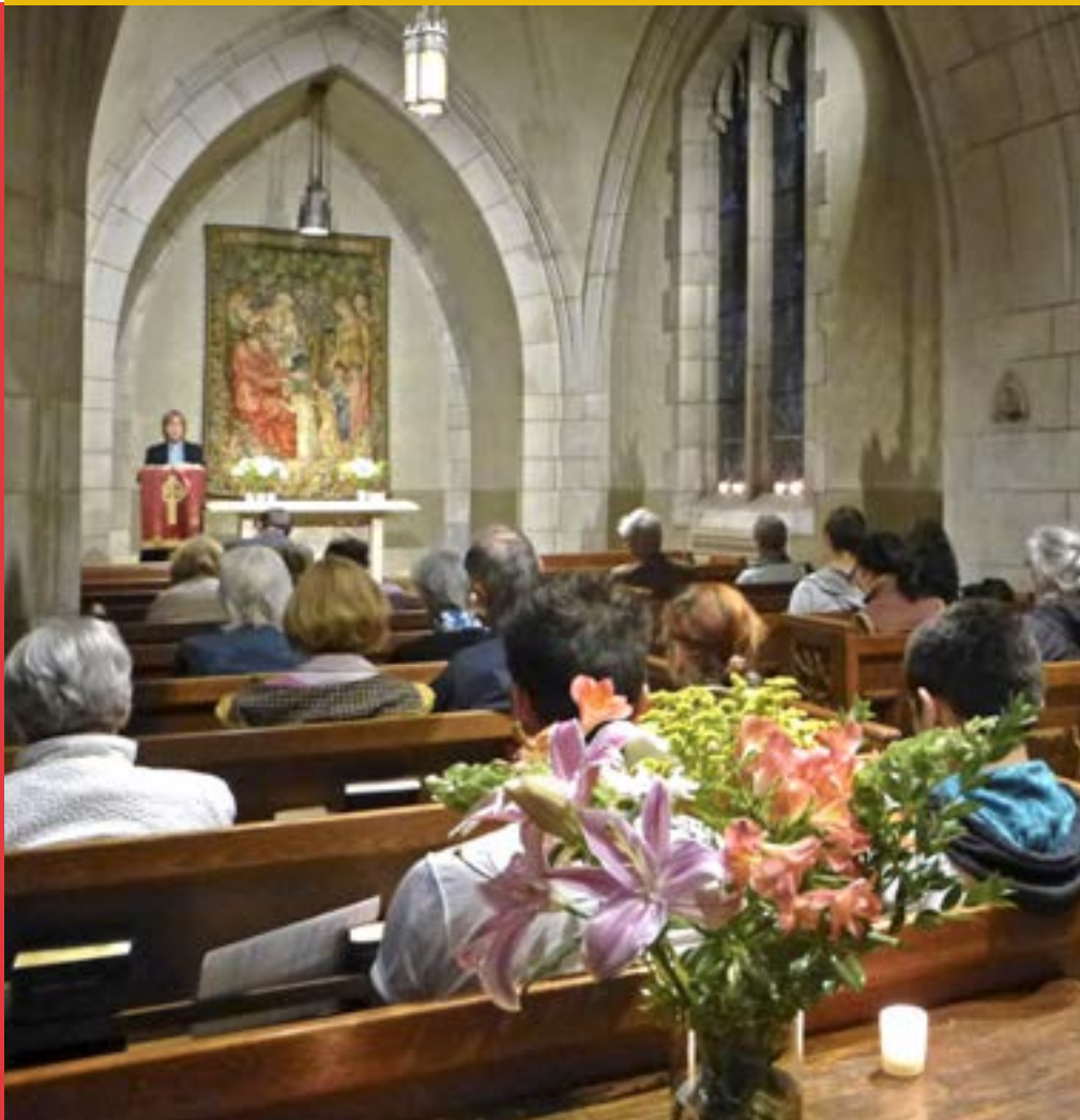
A quiet Taizé Service in the Chapel.